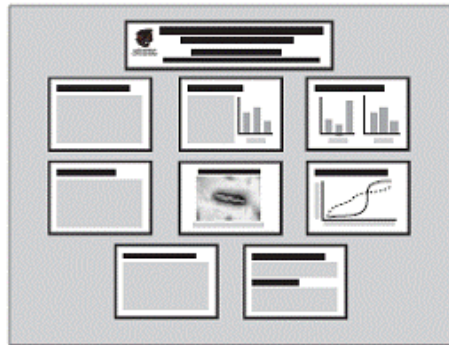
Figure 2: Panel method

The allocated poster area is divided up into a number of separate panels (Figure 2). These may consist of different elements such as text, pictures, tables or titles. Use a standard word-processor or presentation software (e.g. Word or Power Point)